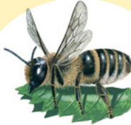
Leafcutter bee Look like a honey bee but cuts neat semi-circles from leaves