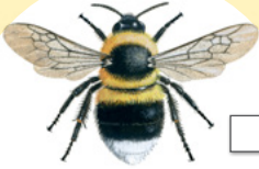
White-tailed bumblebee Yellow and black bands and white tail