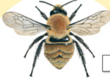
Common carder bee Mainly brown or ginger body but shade can vary according to location