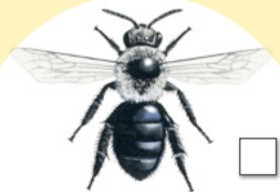
Ashy mining bee Black body with ashy bands across the thorax

Bonus points – Look out for these other pollinators