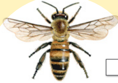
Honey bee Long, slim bee that makes honey