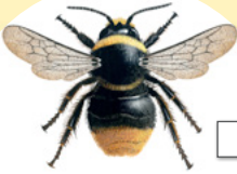
Red-tailed bumblebee (male) Yellow ruff around face, black body and red tail