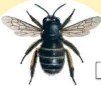
Hairy-footed flower bee (female) Jet-black body and orange back legs