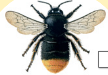
Red-tailed bumblebee (female) Black body and orange-red tail