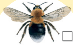
Tree bumblebee Ginger thorax, black abdomen and white tail