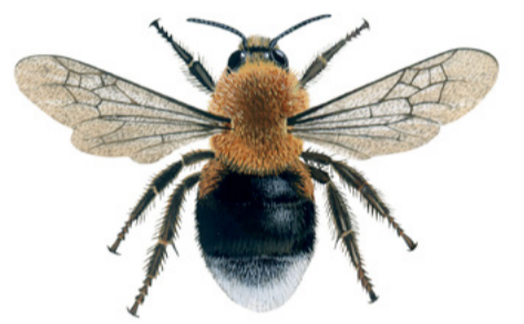
Tree bumblebee Bombus hypnorum • Ginger, black and white • Can be found nesting in bird boxes