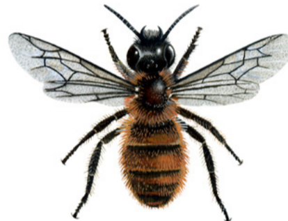
Red mason bee Osmia bicornis • Dense, gingery hair • Likes to nest in mortar of old walls