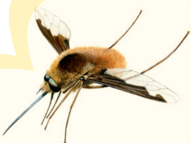
Bee fly Bombus terrestris • Very long proboscis • High-pitched buzz