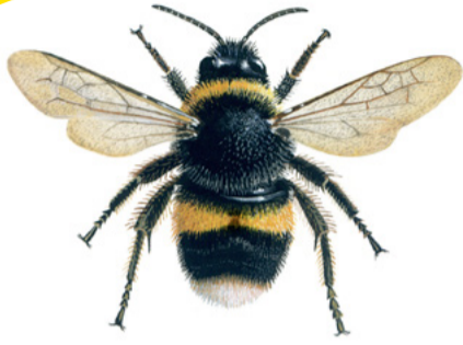
Buff-tailed bumblebee Bombus terrestris • Dirty white tail • Collects pollen from many plants

There are around 250 species of bee in the UK. Here are just a handful that you may spot in your garden.