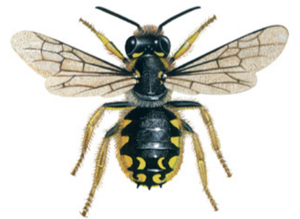
Wool carder bee Anthidium manicatum • Yellow markings down body • Males have spines on the tail