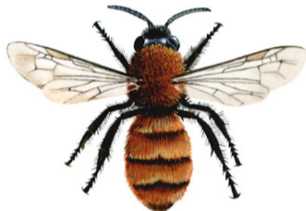
Tawny mining bee Andrena fulva • Nests in dry soil • Makes volcano-like mounds of soil