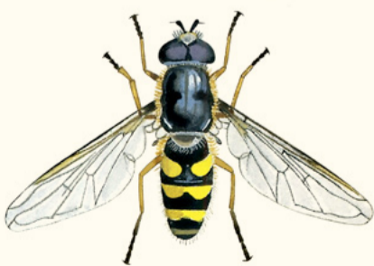
Hoverfly • Hovering and darting movement • Large eyes

friends of the earth see things differently