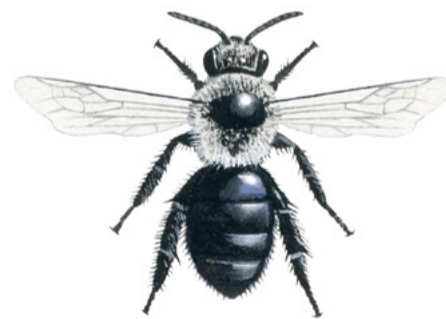
Ashy mining bee Andrena cineraria • Ground-nesting • Black with ashy band across thorax