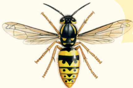
Social wasp • Striped abdomen • Makes nests from chewed wood