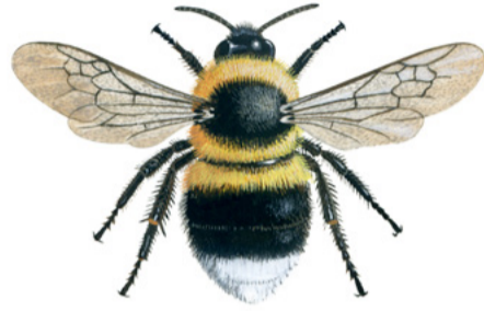
Garden bumblebee Bombus hortorum • Tends to visit long, tubular flowers due to its long tongue