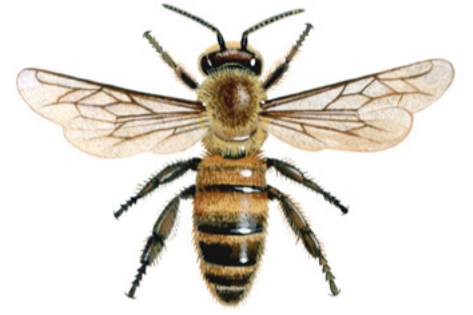
Honey bee Apis mellifera • Works with others from the hive to make honey • Long, slim body