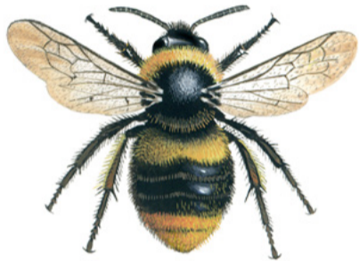
Early bumblebee Bombus pratorum • Small and fluffy • Orange tail