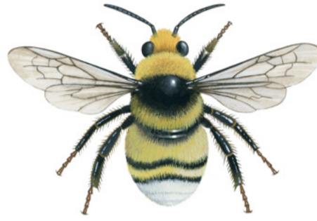
White-tailed bumblebee Bombus lucorum • Lemon-yellow coloured bands • Seen as early as February