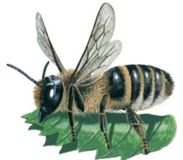
Leafcutter bee (Willughby's) Megachile willughbiella • Cuts neat semi-circles from leaves • Large jaws