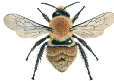
Common carder bumblebee Bombus pascuorum • Tawny brown body • Can be seen flying in November