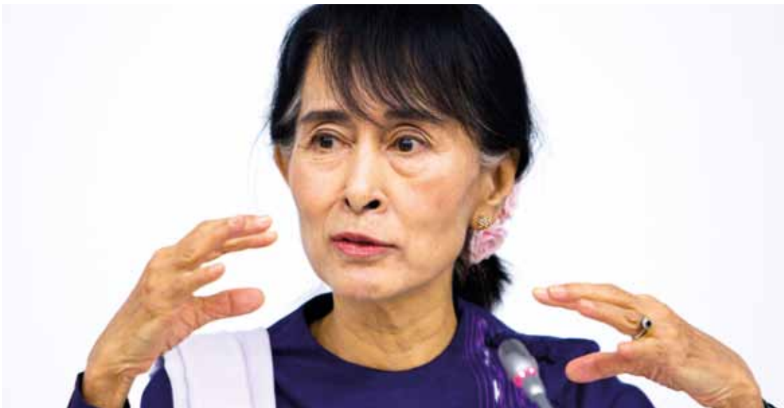
Aung San Suu Kyi, of the National League for Democracy, Myanmar. Is more power for women the key to a sustainable future?

This research will influence future campaigns by Friends of the Earth's Just Transition Programme, as well as aiming to broaden the debate around women's empowerment beyond simply child-bearing.