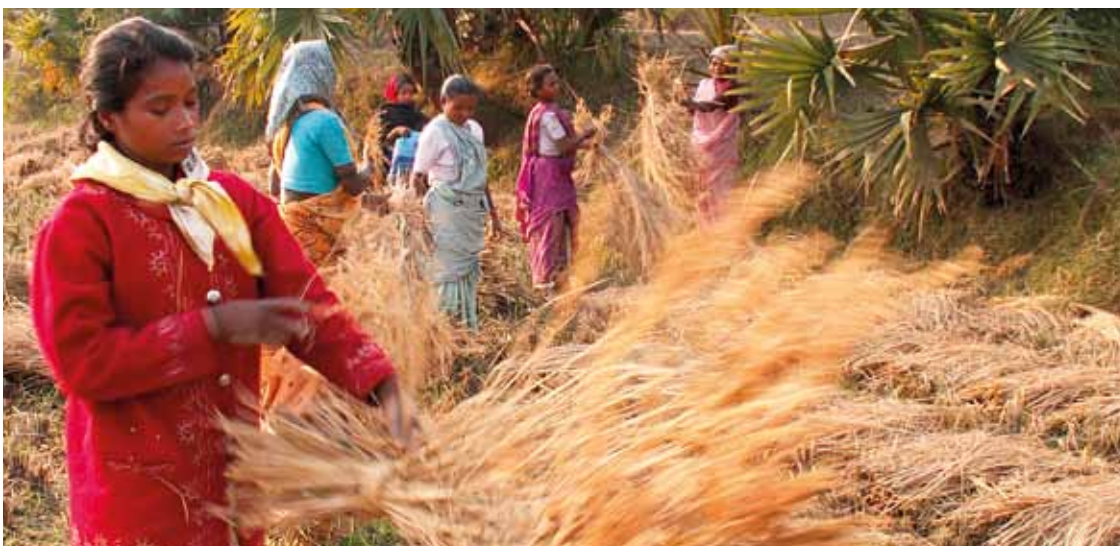
Harvesting, Bangladesh. Food vs fuel, wilderness vs development. What's the right balance for the planet?

The issue of how to feed a growing population is quickly emerging as a priority issue for governments and the international community. While there's been much talk of methods for increasing yield, little attention has been paid to the multiple threats to bioproductivity. The research will pull together evidence on the threats to bioproductivity and for the first time identify a level of sustainable harvest. Interventions and campaigns on how to live within this limit will emerge out of this research – for example on diet. The research will directly feed into Friends of the Earth's food campaigning which is led by the organisation's Land, Food and Water Security Programme.