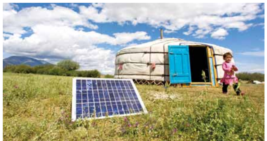
Energy from the sun in Tarialan soum, Mongolia. Well-being for everyone implies higher energy use globally.

Friends of the Earth has led the way in the UK on decentralised energy, with the successful campaign to introduce a feed-in tariff for small-scale renewables and successful legal challenges to prevent the Government fatally weakening the financial incentive. We are now working with sister groups in Friends of the Earth International to secure the delivery of a global feed-in tariff to enable poorer communities across the globe to benefit from decentralised energy. This research will support the campaign and inform future campaigns in related areas such as waste management.